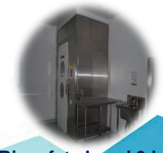
Biosafety Level 3 Lab