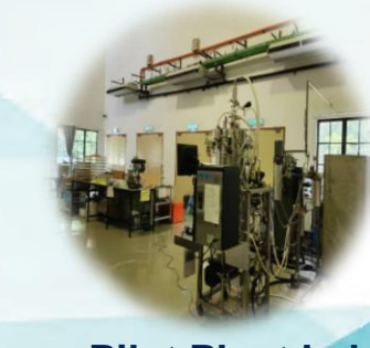
Pilot Plant Lab