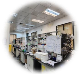
Natural Product Lab