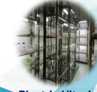
Plant In Vitro Lab