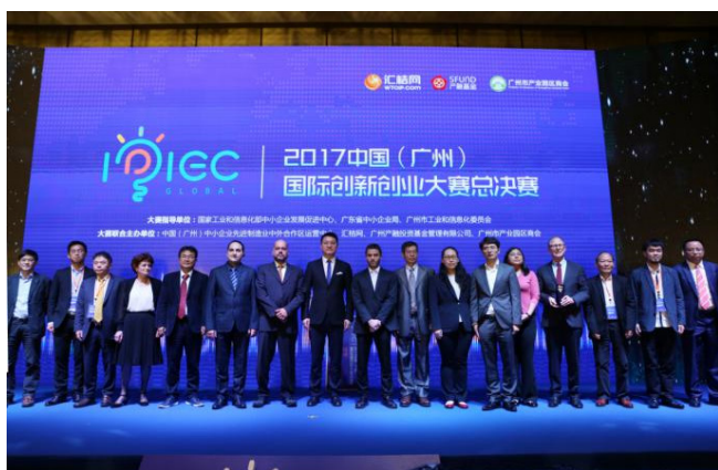
IPIEC GLOBAL 2017