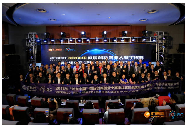
IPIEC GLOBAL 2018

We are hoping to extend our efforts to create an effective means to connect innovations with capital and enterprises, overseas projects with local clusters, as well as commercialization with government policies, in an attempt to promote cross-border technology cooperation and accelerate local industrial upgrade. Meanwhile, we also strive to help more Chinese enterprises and organizations go overseas for market expansion.