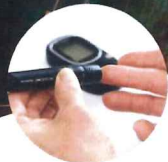
MEDICAL DEVICES & CLINICAL HEALTHCARE

In conjunction with the 1st World Congress on Falls & Postural Stability 2019