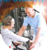
BIOMECHANICS, ERGONOMICS & REHABILITATION