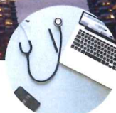
TELEMEDICINE & POINT OF CARE HEALTHCARE SOLUTIONS