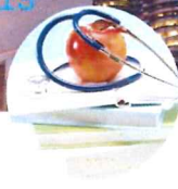
TECHNOLOGY TRANSFER FROM THE RESEARCH INNOVATION BENCH TO COMMERCIALIZATION